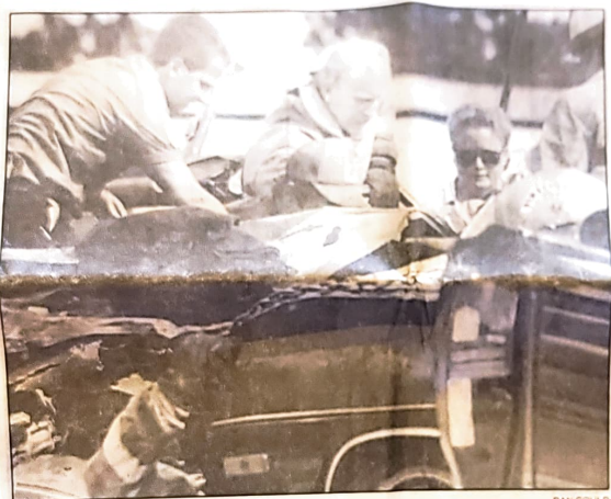
An emergency crew works to free the driver of one of the cars